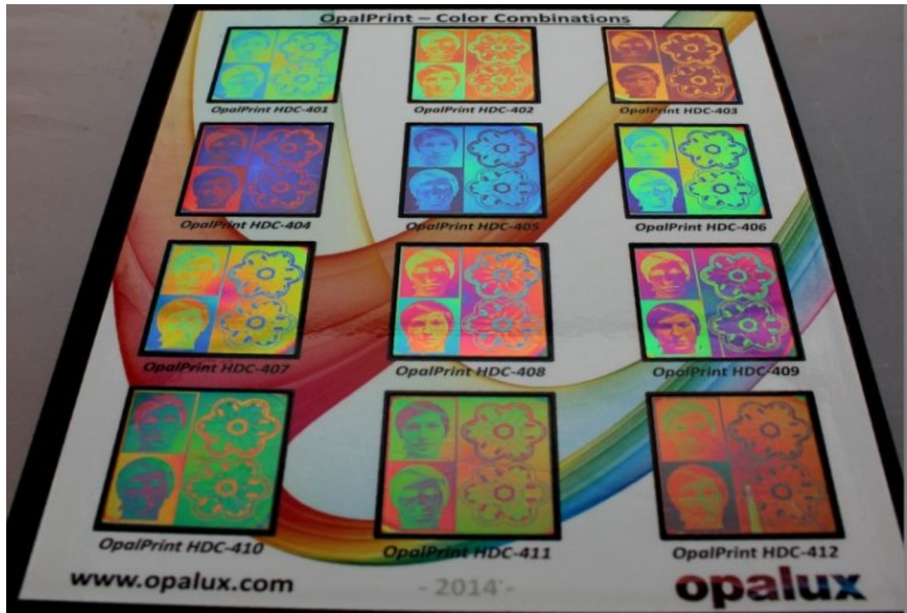
OpalPrint color combinations – courtesy of Opalux Inc.

finger pressure [6]. The pressure threshold, duration of activation and other aspects can all be customized. ElastInk can be produced in a wide variety of form factors, including as a security thread for paper banknotes. This latter variant meets circulation hazard requirements for paper banknotes. Depending on security requirements, ElastInk's appearance change can be either reversible or irreversible. For example, when used as a security thread in a banknote, a reversible variant is employed. However, for other applications such as tamper evidence, irreversible variants and variants that reverse in response to specific stimuli like heat may be employed. ElastInk is available in a range of initial colors, including red, yellow, green and blue, and a variety of pressure thresholds. Several variants of ElastInk are reserved for high security documents.