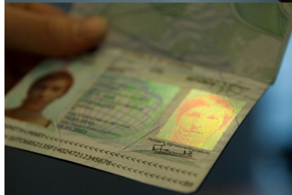
OpalPrint roll-to-roll manufactured photonic color base material fabricated into product specific security features on banknotes, identification cards and passports